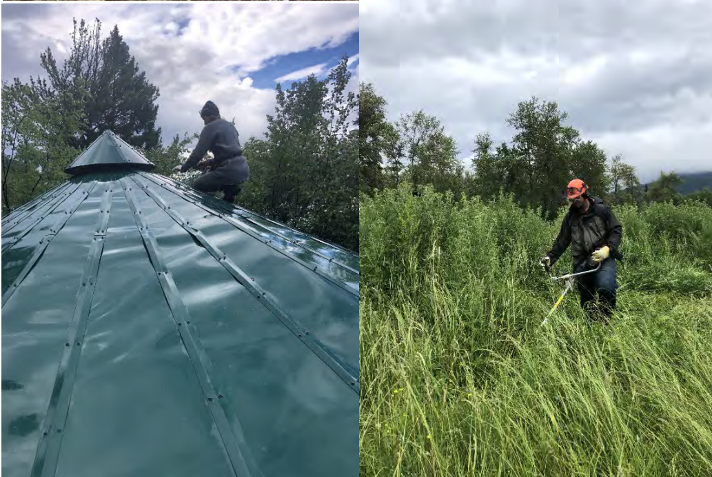
Photo 13 and 14: Water tower removal – Columbia Lake East Photo 15: Canada Thistle treatment – Duncan Flats