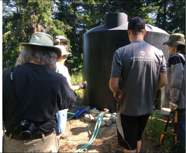
Englishman River: WCCLMP Crew working with volunteers on watering program to maintain previous planting