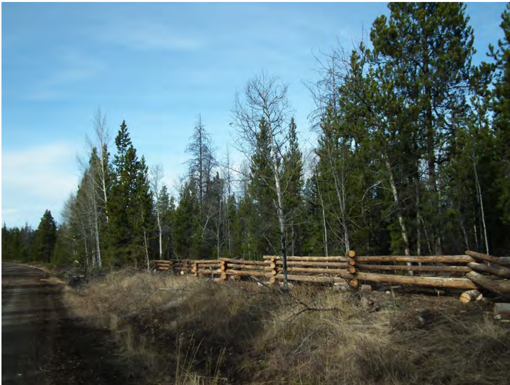
4. Chilcotin Lake and Marsh log fence completed.