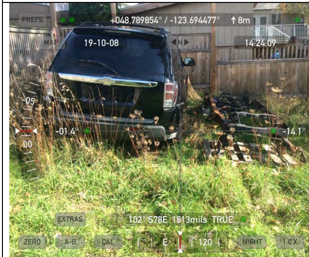
S'amunu WMA Trespassing: Vehicle and Debris parked within WMA boundary