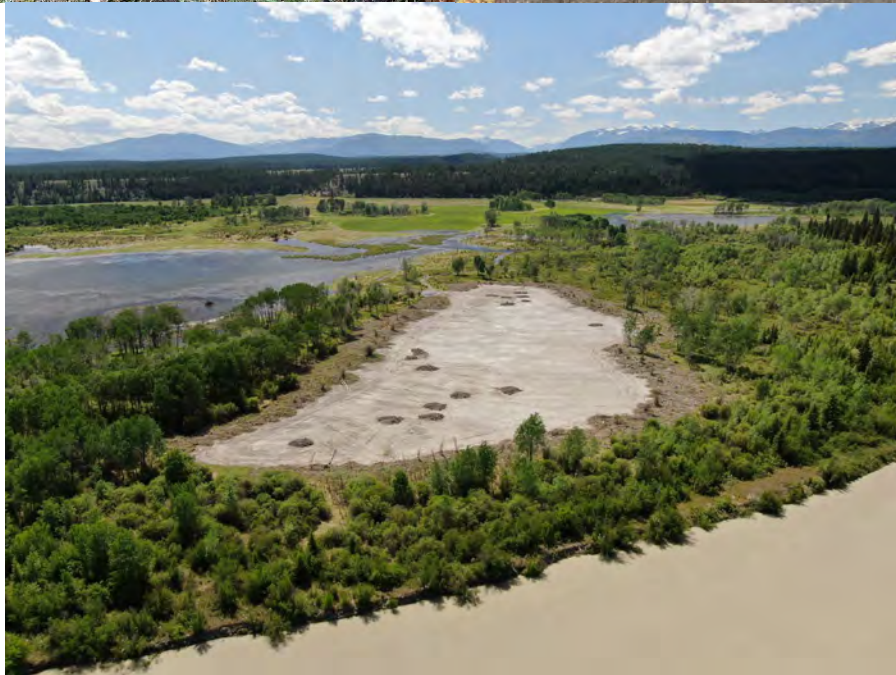
Photo 4: Wildfire thinning work at the Grave Prairie Conservation Property Complex.