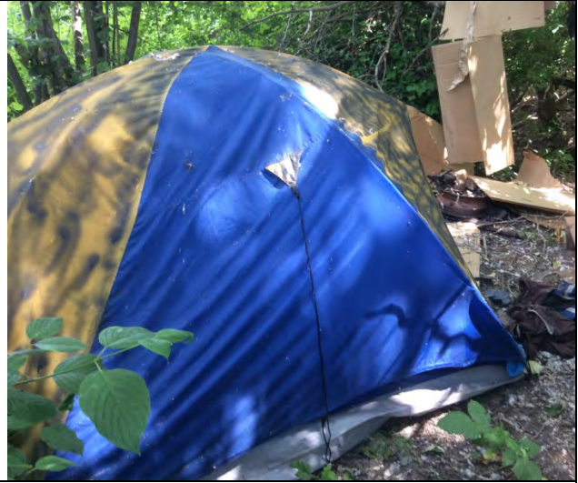
S'amunu WMA: Homeless Camps monitoring and removals