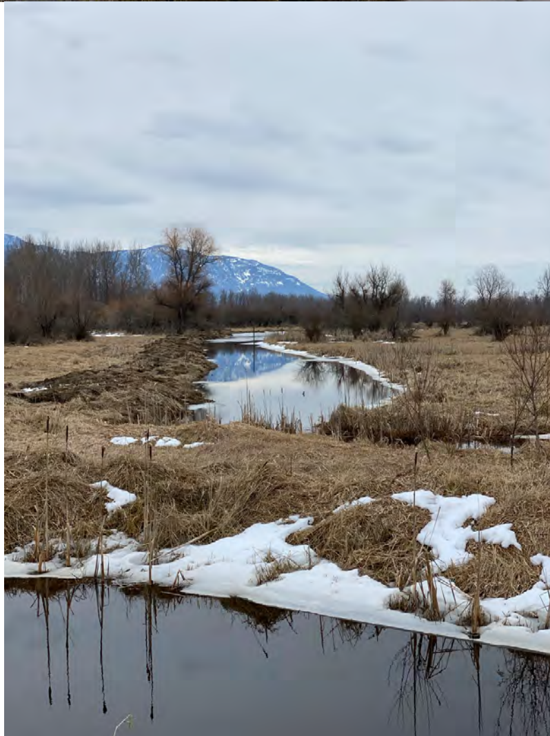
Photo 16, 17 and 18: Vegetation removal at Corn Creek march – Creston Valley Wildlife Management Area