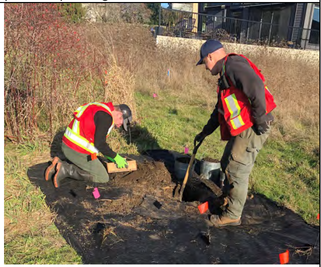
S'amunu WMA Ye'yumnuts: Test holes with Cowichan Tribes archeologist prior to planting/restoration