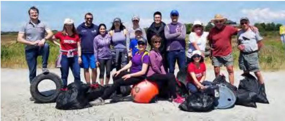
2. Boundary Bay WMA – mapping of Spartina. Community shoreline cleanup.