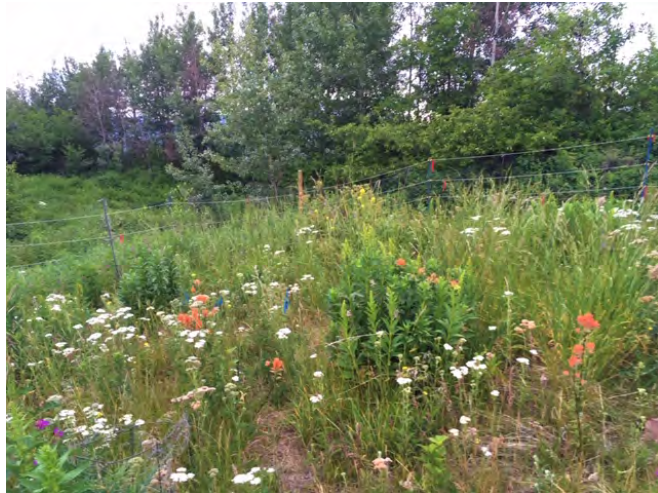
6. Hubert Hill restoration plots: progress through the year.