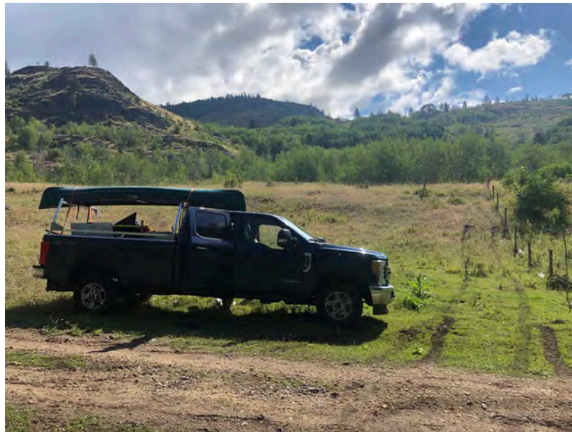
Photo 3: Fence repair at the Grand Forks – Gipin Conservation Property Complex.