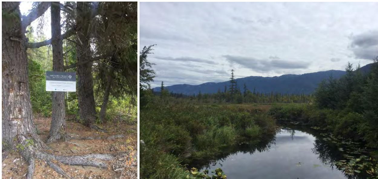
2. Lakelse Lake – Mullers Bay – signs maintained and rubbish removed from shoreline..