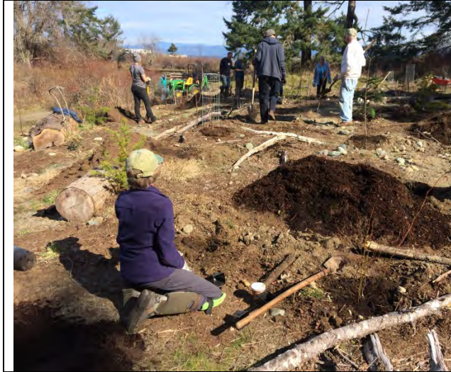
Englishman River: Planting with volunteers at restoration site