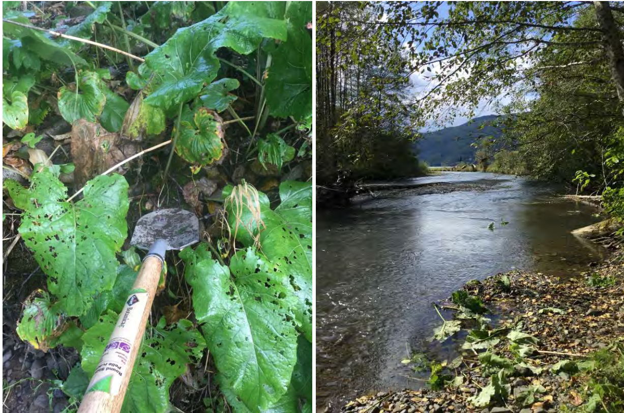
1. Alice Arm – mechanical management of invasive plants (giant burdock) in riparian areas.