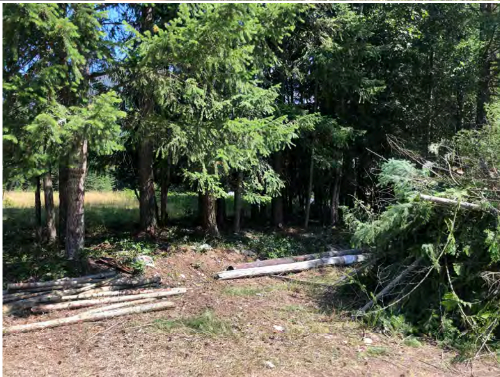
Photo 10: Installation of riparian vegetation exclosure fences at the Earl Ranch Conservation Property. Photo 11: Conservation Property Complex boundary signage installation and kiosk repair at Wigwam Flats Conservation Property Complex. Photo 12: Wildfire interface thinning – Duncan Flats