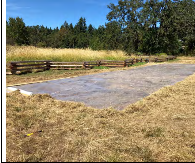
S'amunu WMA Ye'yumnuts: Invasive plant treatment – Solarisation of Reed Canary Grass