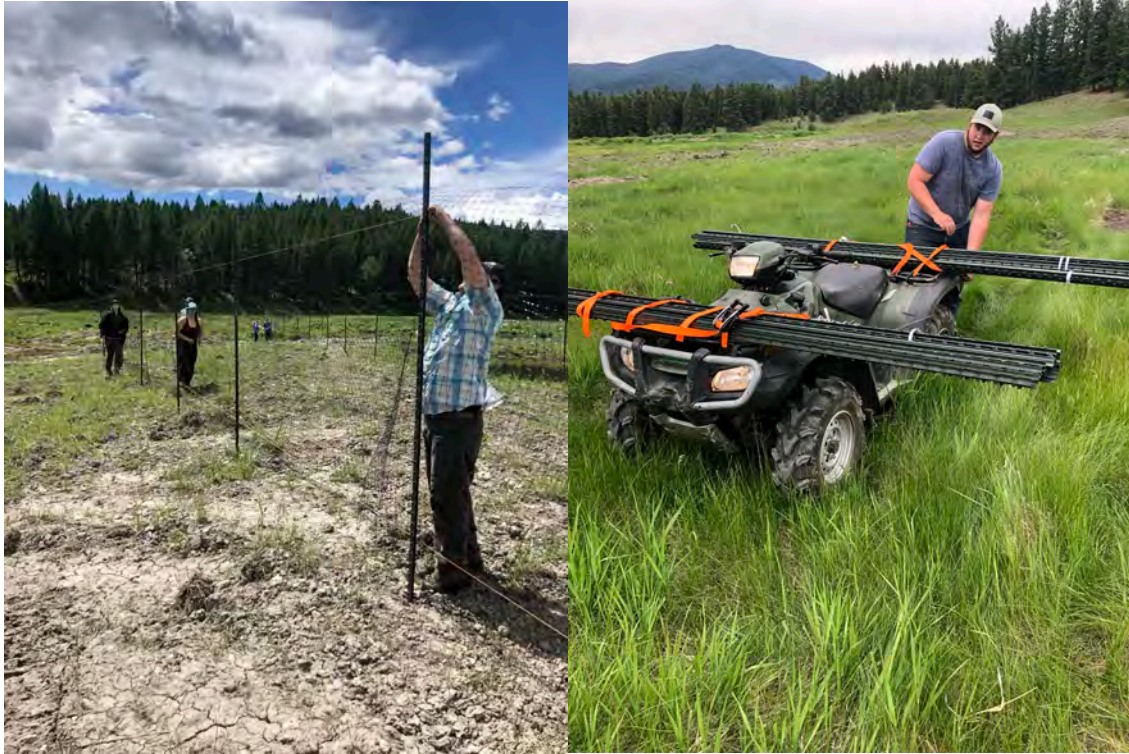
Photo 1 and 2: Work party event at the Newgate Conservation Property. Wetland enclosure building.